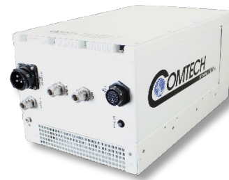
PS 1.5 Model