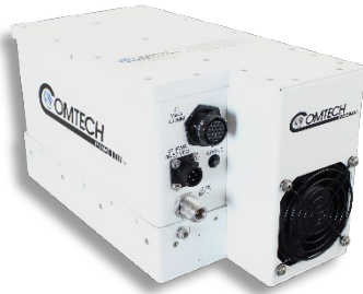
PS 1 Model