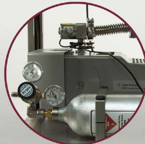
Dry Scroll Pump Gas Cylinder (Optional)

For specific application, user may request drop ship of needed gas mixture