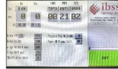
Touchscreen Control Panel