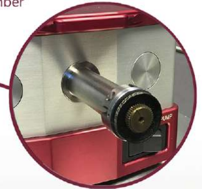
Up to 3 TEM Holder Ports