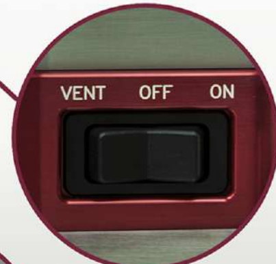
3-Way Toggle Switch