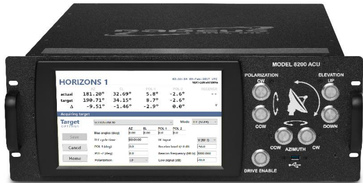
Figure 1: RL8200L Drop-in-Replacement for Vertex Communications 7200 ACU

The 8200L was designed by the SAME team that designed the Vertex Communications 7200 to a person, so the design is solid and rooted in the same Engineering depth and expertise that went into the Vertex product many years ago. Developing the 8200L, however, had some distinct advantages as technology has made many advances over the past 2-3 decades that the team has been able to leverage for the 8200L that were just not yet available or mature enough at the time the 7200 was developed.